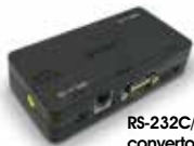
RS-232C/HDMI converter CBX-H11/1