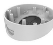
DS-1281ZJ-DM23 Inclined Base Mounting Bracket