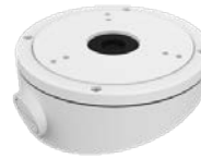
DS-1281ZJ-S Inclined Base Mounting Bracket