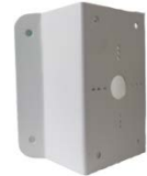
DS-1276ZJ Corner Mounting Bracket