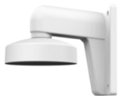
DS-1272ZJ-110-TRS Wall Mounting Bracket