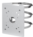
PFA150 Pole mount