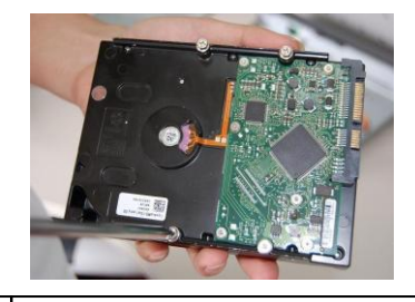
2. Fix four screws in the HDD (Turn just three rounds).