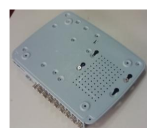
4. Turn the device upside down and then turn the screws in firmly.