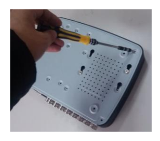
5. Fix the HDD firmly.